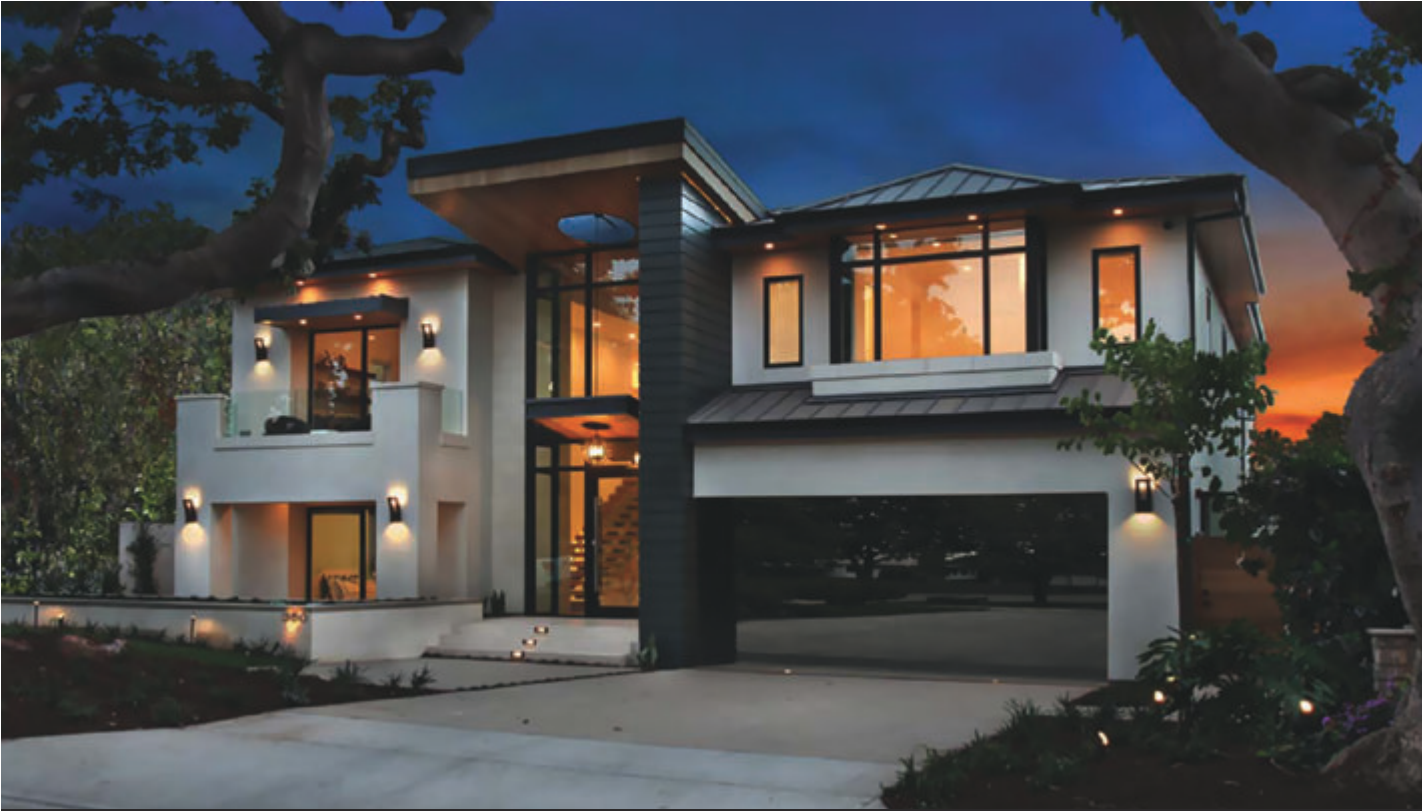
Sterling, Model 2717 shown in tinted infinity glass.